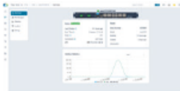
Entra vPON Manager